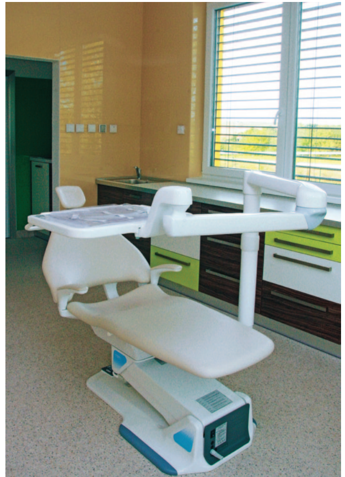
Lacobel AntiBacterial used as wall covering in Stomamed (dentist surgery) in Tábor (Czech Republic).

* For extra safety a polypropylene SAFE+ film can be placed on the painted side of Lacobel AB and Mirox AB.