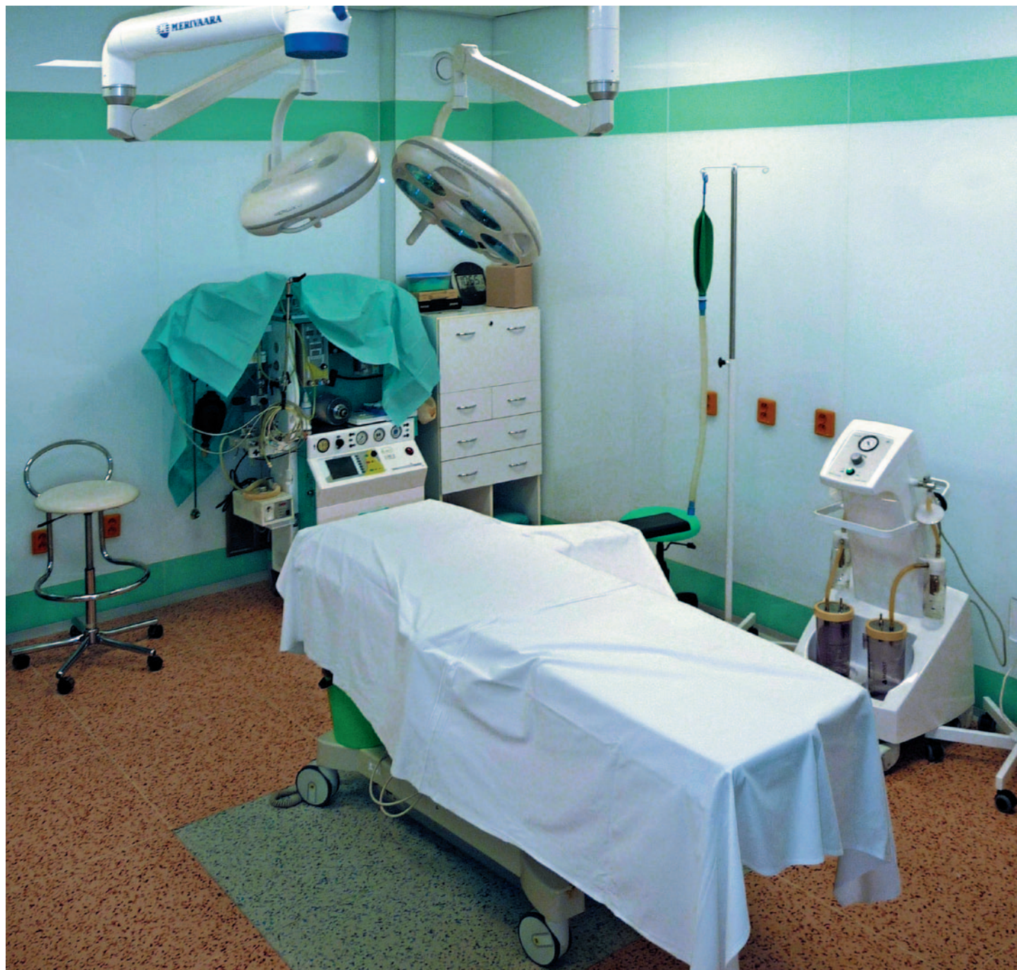
Lacobel AntiBacterial SAFE+ used as wall covering in Health Centre NovaMed operating room in Banská Bystrica (Slovak Republic).