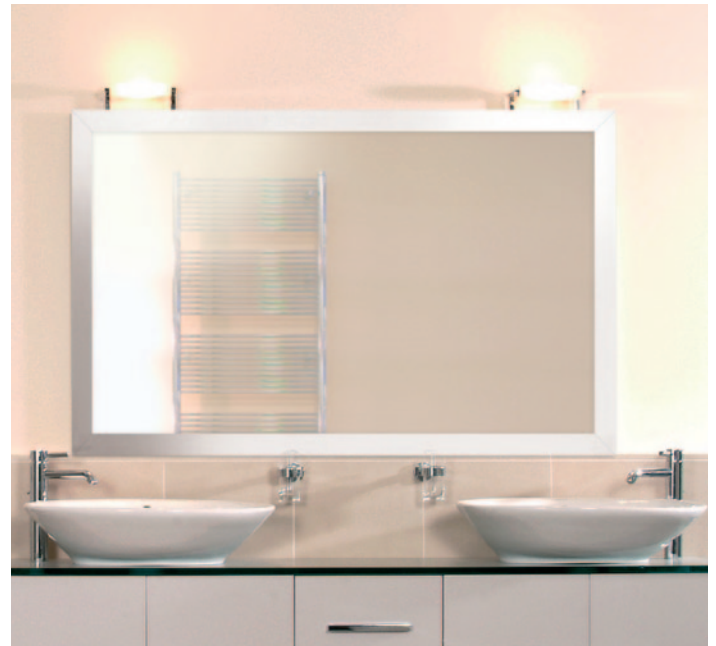
MIROX AB Mirrors