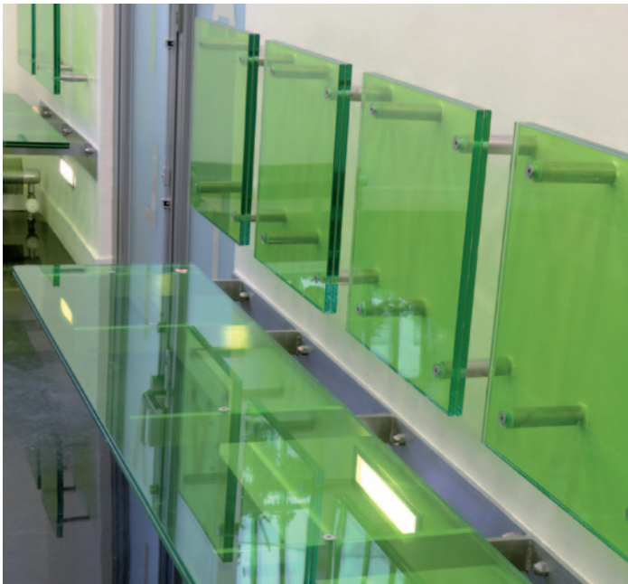
PLANIBEL AB Tinted, laminated PLANIBEL AB used on waiting room benches