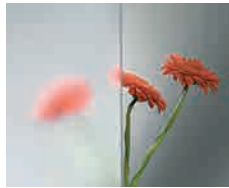
Clearvision Highly transparent float base for pure aesthetics