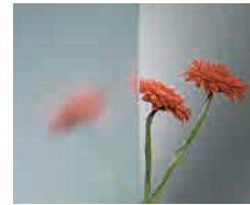
Linea Azzurra Slightly blue tinted float base