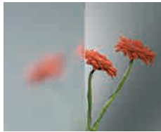
Clear Normal float base