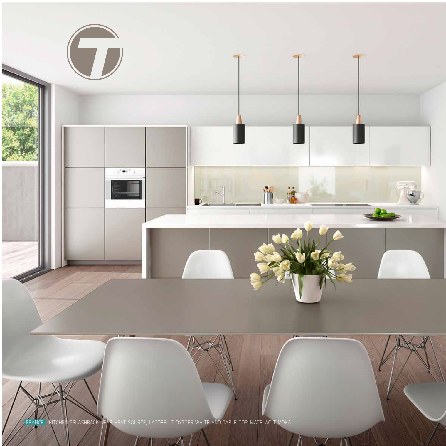
FRANCE KITCHEN SPLASHBACK NEAR HEAT SOURCE, LACOBEL T OYSTER WHITE AND TABLE TOP, MATELAC T MOKA