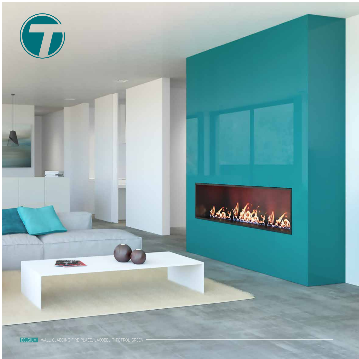
BELGIUM WALL CLADDING FIRE PLACE, LACOBEL T PETROL GREEN