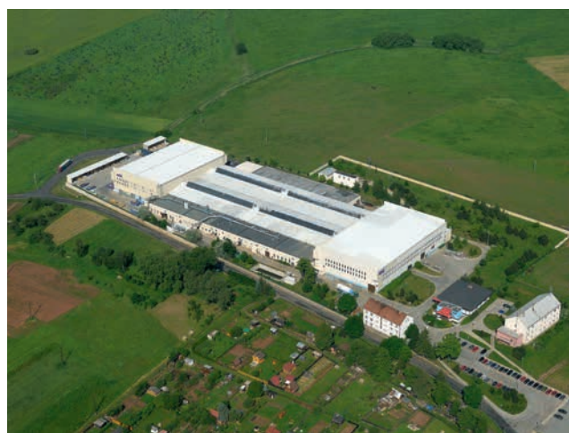
Kryry plant, Czech Republic