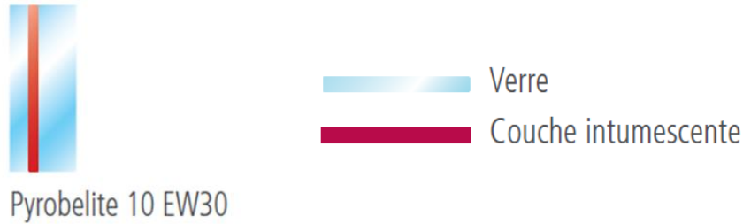
Figure 1: Structure of a Pyrobelite 10 Stock-Size

Figure 1 shows the structure of the reference product only.