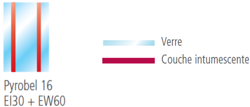
Figure 1: Structure of a Pyrobel 16 Cut-Size

Pyrobel 16 Cut-Size comes in a smaller form than the 3.21 x 2.25 m panel, with no defined minimum size. Figure 1 shows the structure of the reference product only.