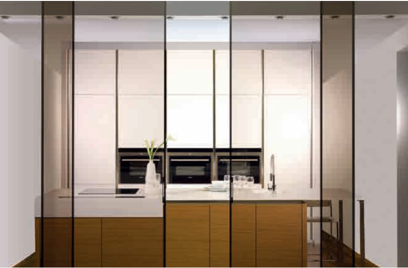
HUNGARY SLIDING DOORS, PLANIBEL BRONZE - © ALU-STYLE KFT