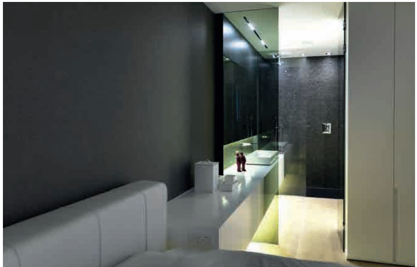
BELGIUM PARTITION, PLANIBEL GREY