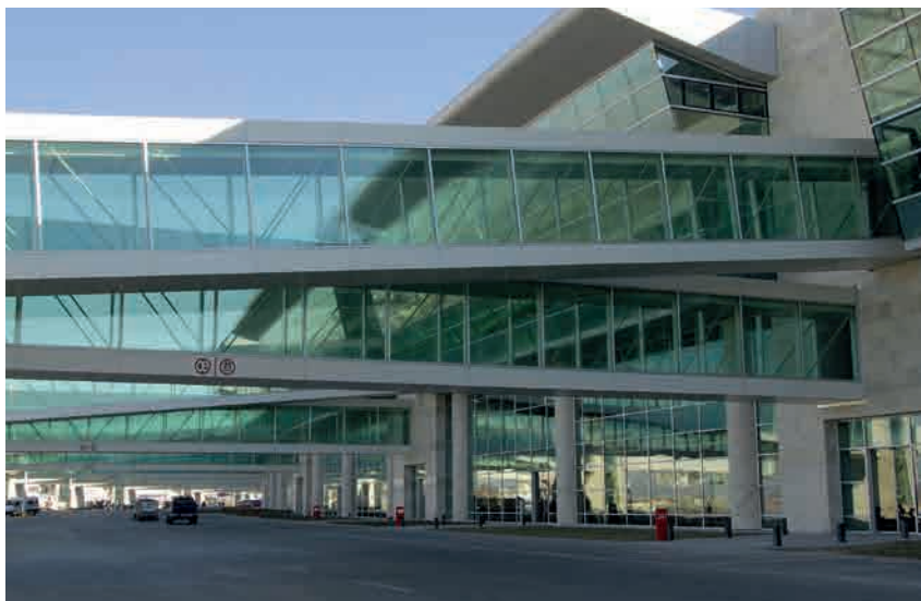
TURKEY FACADE CLADDING, AIRPORT, PLANIBEL GREEN