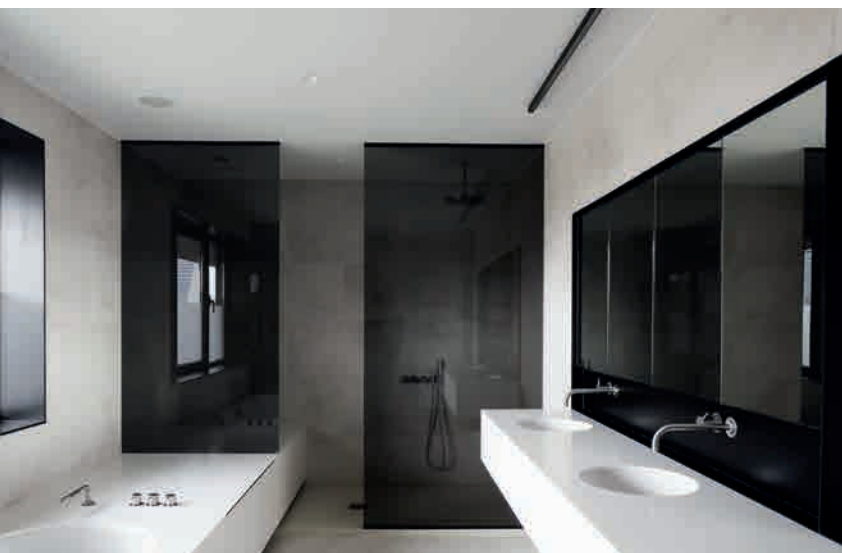
BELGIUM SHOWER SCREEN, PRIVATE HOME, PLANIBEL DARK GREY © REID SENEPART ARCHITECTEN - PHOTOGRAPHER THOMAS DE BRUYNE