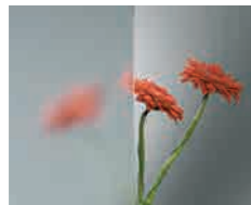
Clear Normal float base