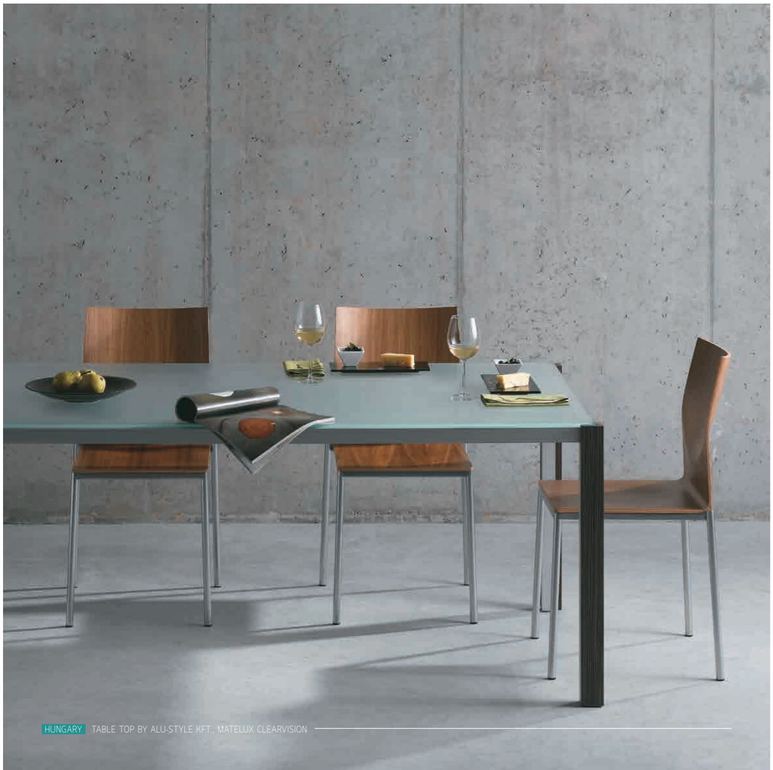
HUNGARY TABLE TOP BY ALU-STYLE KFT., MATELUX CLEARVISION

MATELUX products are Cradle to Cradle Certified® Bronze.