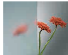
Linea Azzurra Slightly blue tinted float base