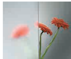
Clearvision Highly transparent float base for pure aesthetics