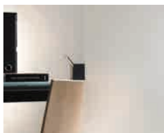
Stratobel White Mat 65