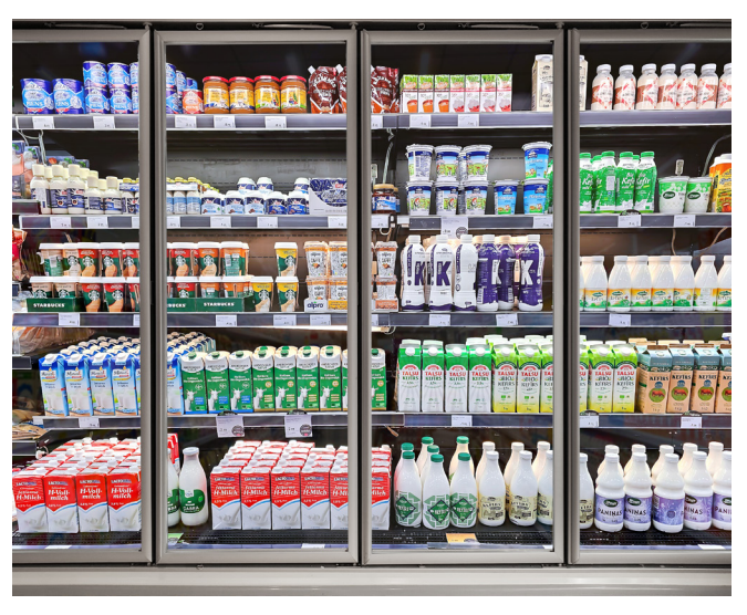
With Clearsight Lite and Clearsight Lite Comfort