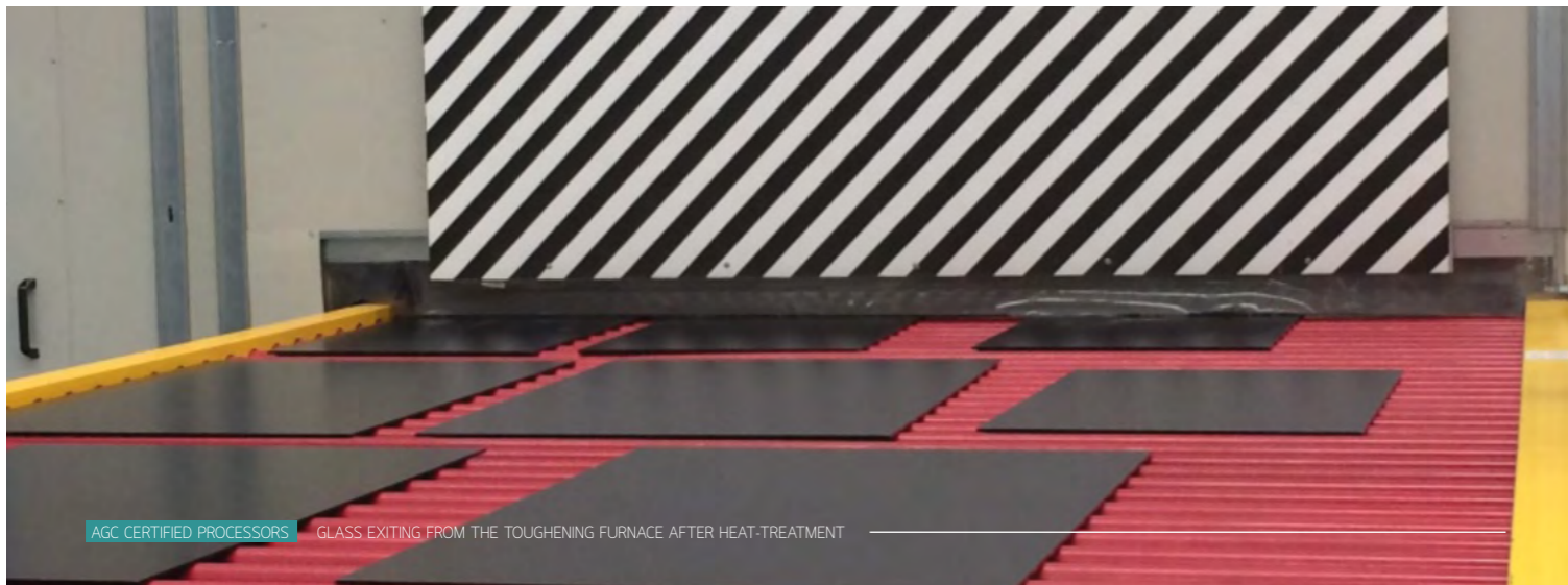
AGC CERTIFIED PROCESSORS GLASS EXITING FROM THE TOUGHENING FURNACE AFTER HEAT-TREATMENT

In 2021 AGC launched a network of decorative glass experts, called the AGC Deco partners. The aim of this network is to consolidate the expertise on our decorative products among our customers and to facilitate access to our range of products to their own clients.