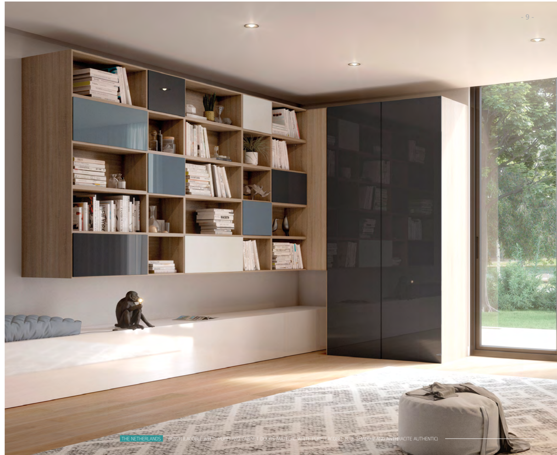
THE NETHERLANDS BENCH (LACOBEL WHITE PURE) AND CABINET DOORS (MATELAC WHITE PURE, LACOBEL BLUE SHADOW AND ANTHRACITE AUTHENTIC)