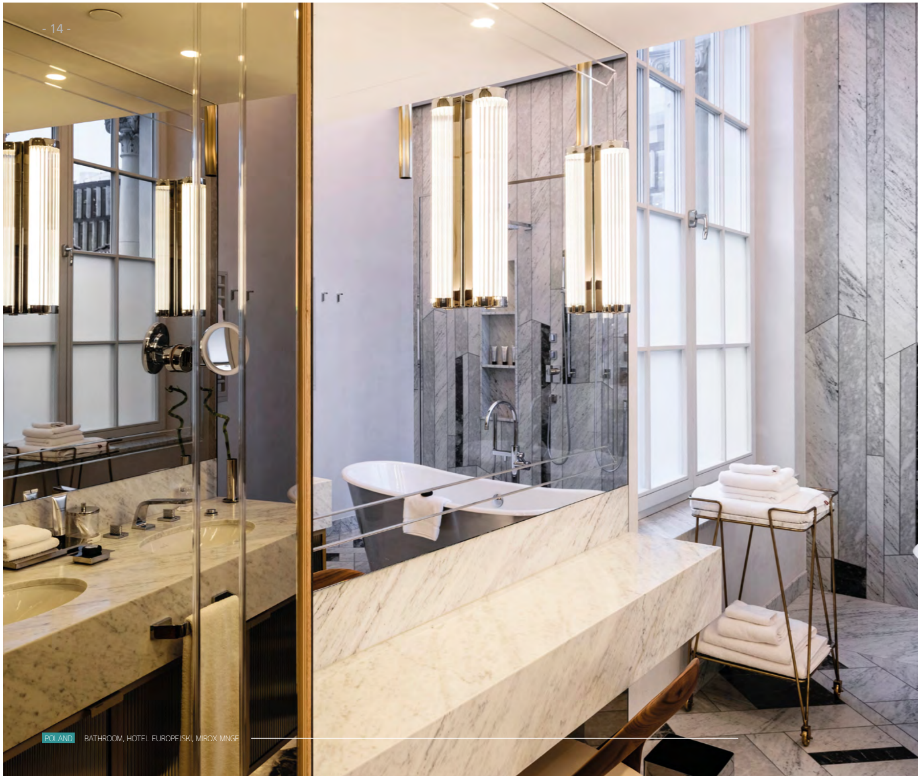
POLAND BATHROOM, HOTEL EUROPEJSKI, MIROX MNGE