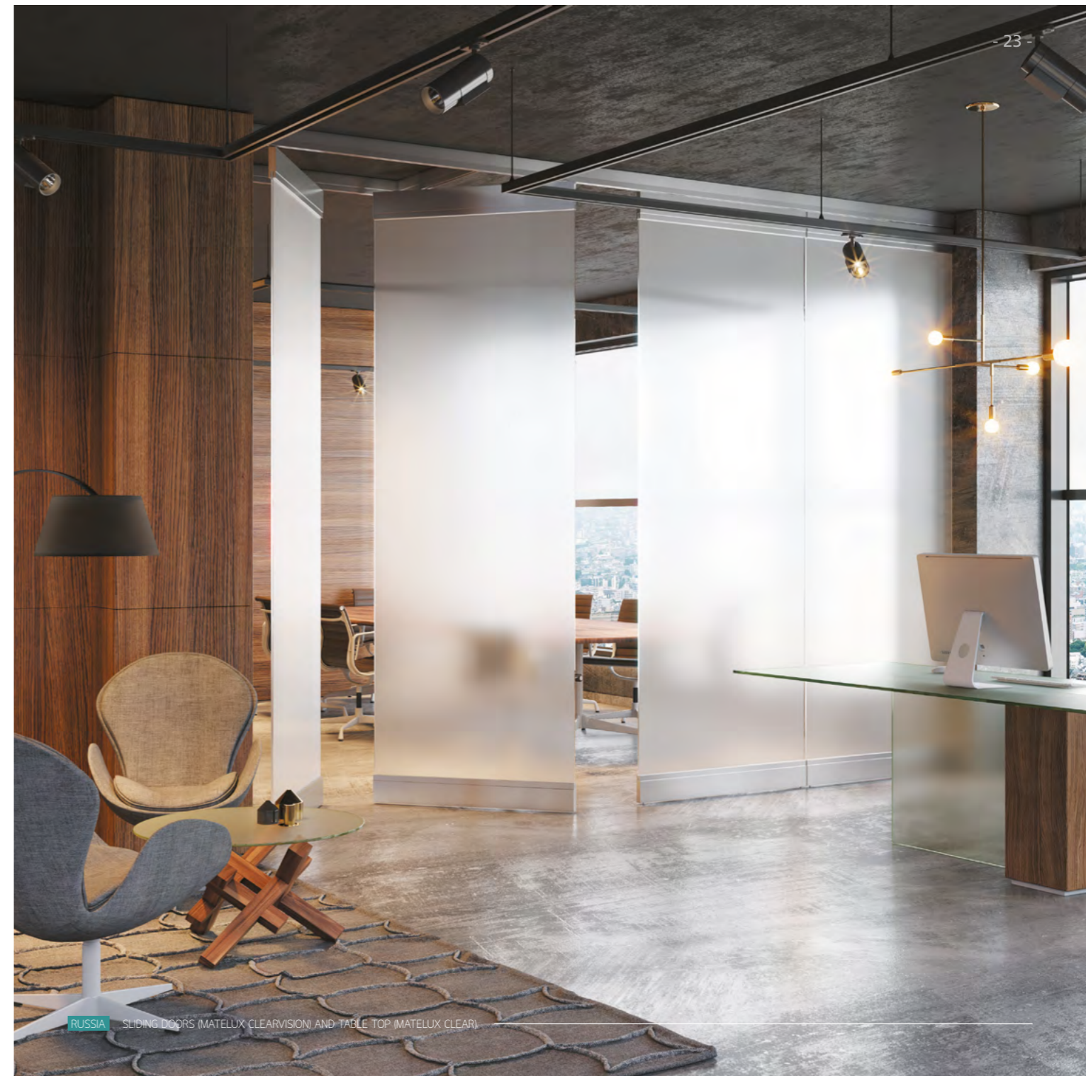
RUSSIA SLIDING DOORS (MATELUX CLEARVISION) AND TABLE TOP (MATELUX CLEAR)