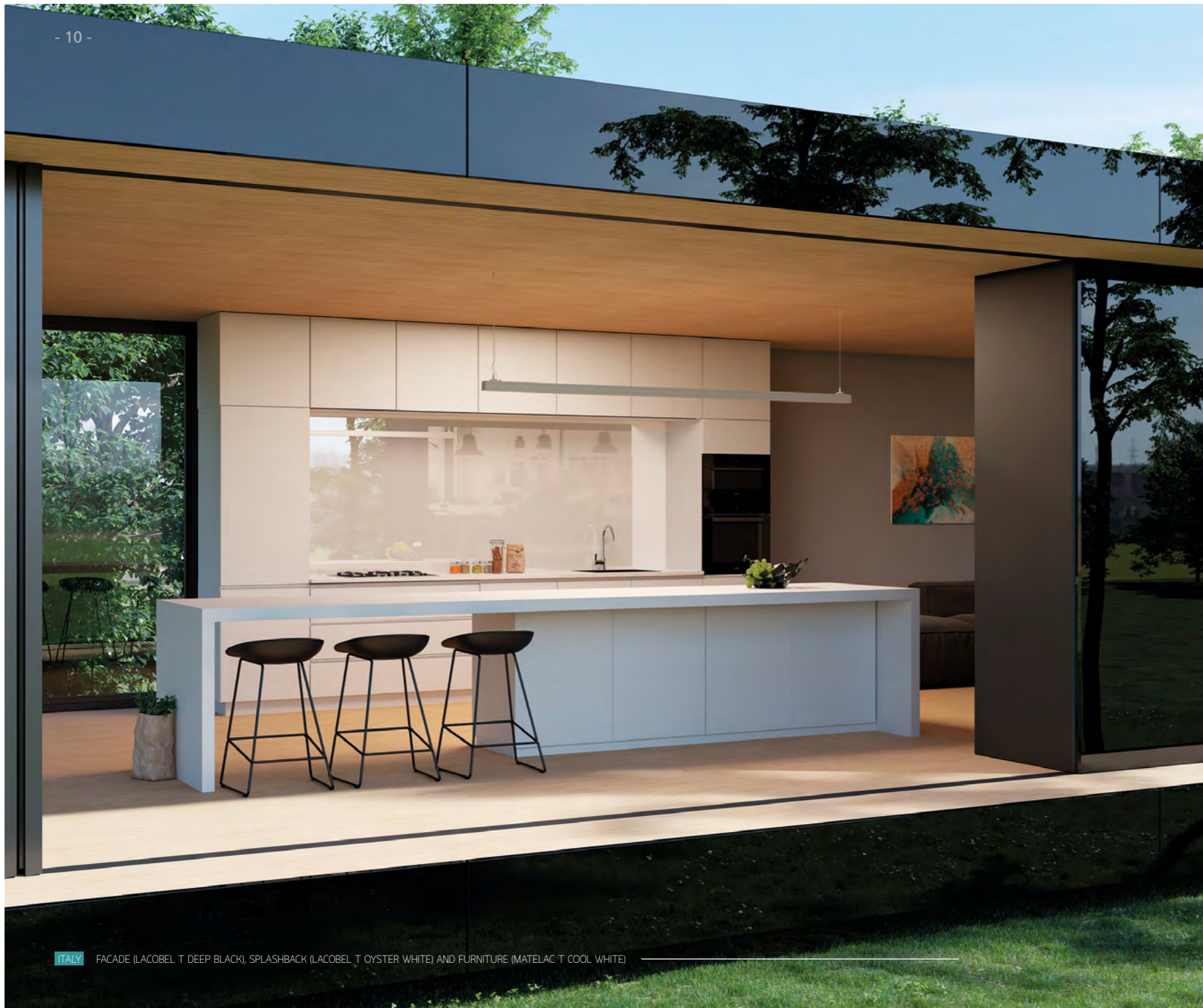
ITALY FACADE (LACOBEL T DEEP BLACK), SPLASHBACK (LACOBEL T OYSTER WHITE) AND FURNITURE (MATELAC T COOL WHITE)