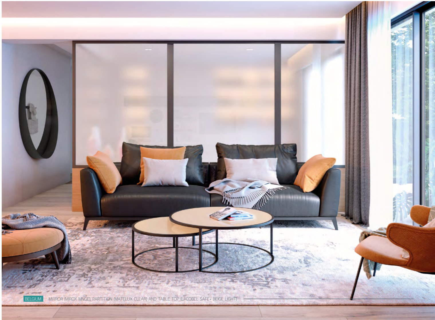
BELGIUM MIRROR (MIROX MNGE), PARTITION (MATELUX CLEAR) AND TABLE TOP (LACOBEL SAFE+ BEIGE LIGHT)