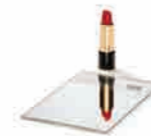
Clearvision Highly neutral float base for pure aesthetics