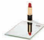
Clear Normal float base