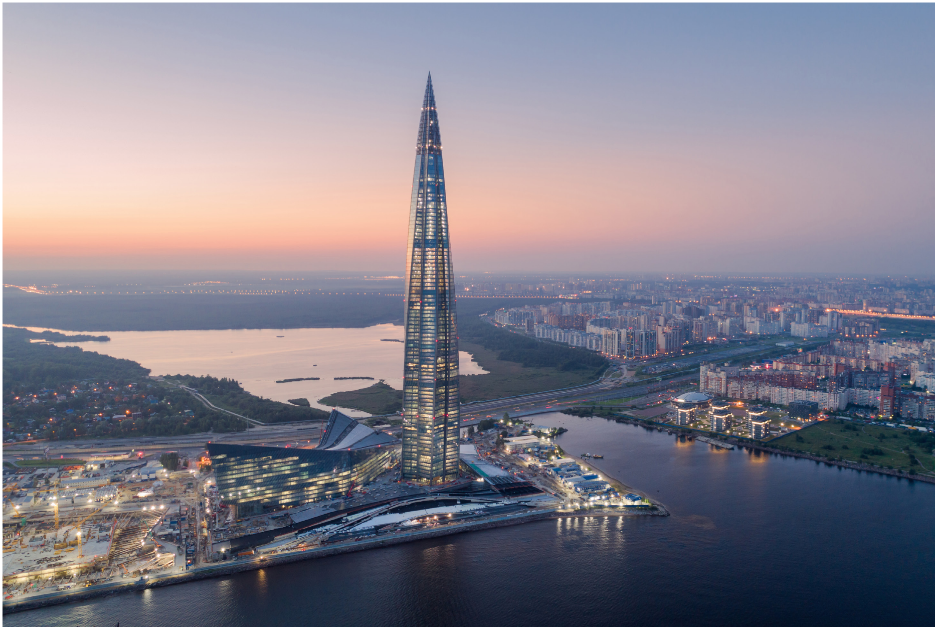
RUSSIA SAINT PETERSBURG, LAKHTA CENTRE - ENERGY 72/38, IPASOL BRIGHT WHITE ON CLEARVISION AND PLANIBEL LINEA AZZURRA - TONY KETTLE AND GORPROJECT CJCS - LEED PLATINUM