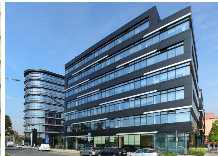
HUNGARY BUDAPEST, VÁCI 33 - STOPRAY VISION-61T - LEED SILVER