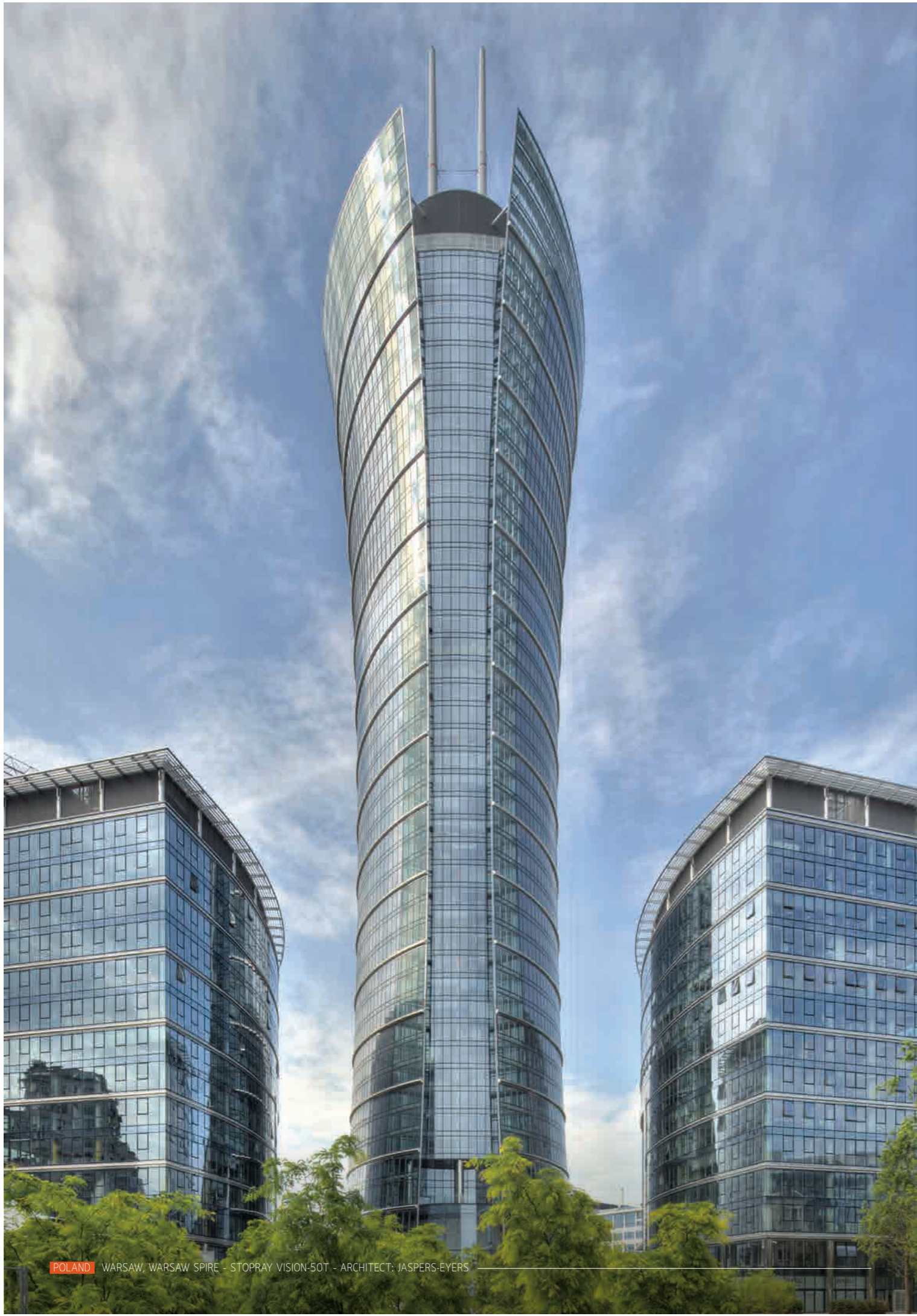
POLAND WARSAW, WARSAW SPIRE - STOPRAY VISION-SOT - ARCHITECT: JASPERS-EYERS