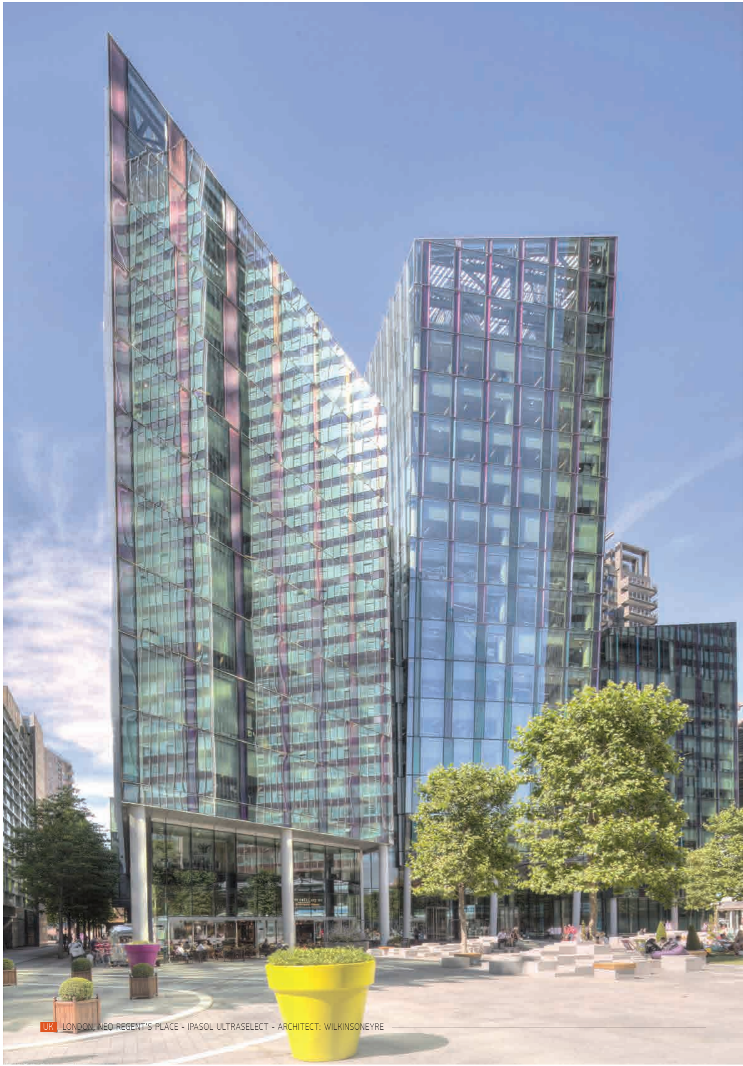
UK LONDON: NEO REGENT'S PLACE - IPASOL ULTRASELECT - ARCHITECT: WILKINSONEYRE