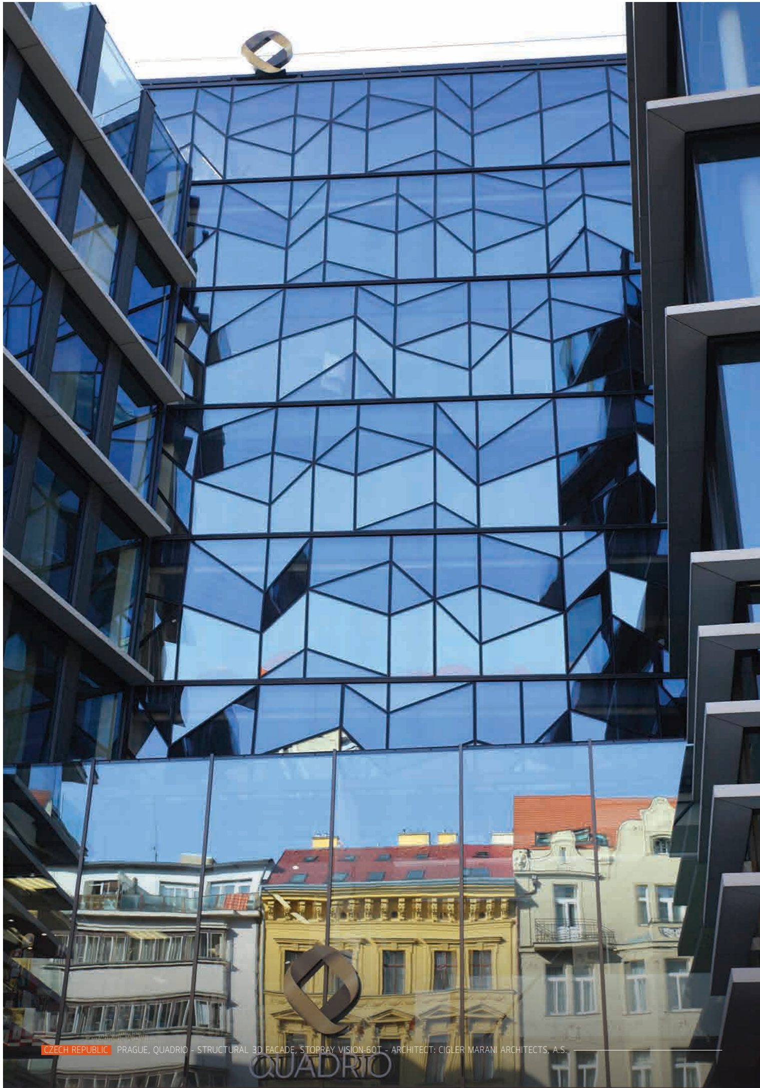
CZECH REPUBLIC PRAGUE, QUADRIO - STRUCTURAL 3D FACADE, STOPRAY VISION-60T - ARCHITECT: CIGLER MARANI ARCHITECTS, A.S.