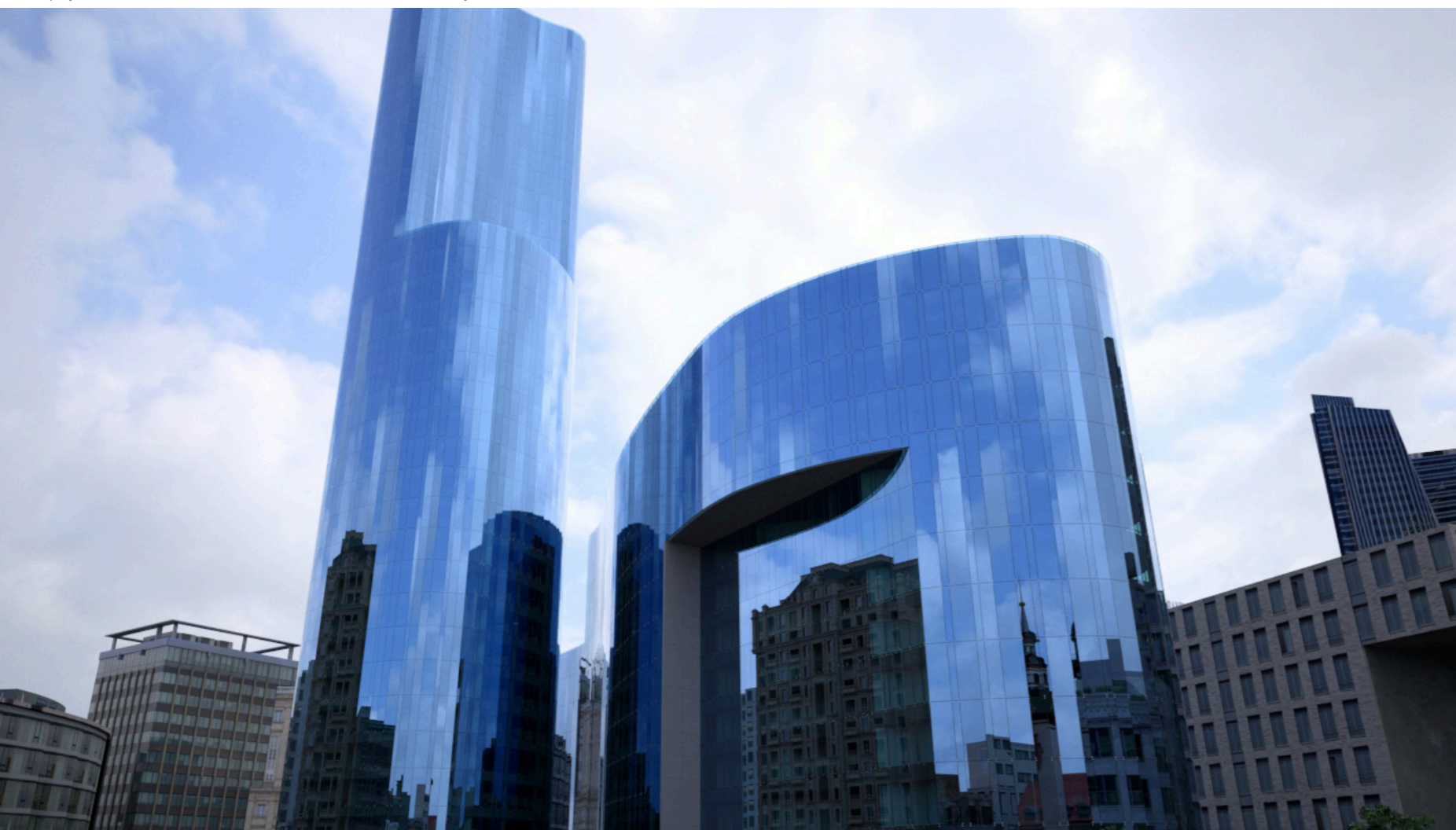
Stopray Blue Ace-30T 6mm - 16mm 100% Air - Clear float 6mm, sunny environment