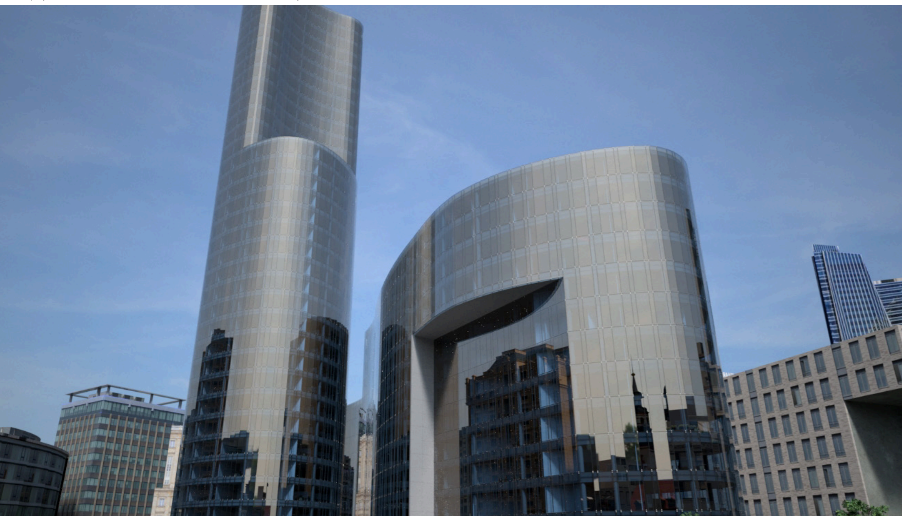
Stopray Bronze Ace-30T 6mm - 16mm 100% Air - Clear float 6mm, cloudy environment

The calculations were made with AGC Glass Configurator available at www.agc-yourglass.com . All calculations are subject to fabrication tolerances and unit composition.