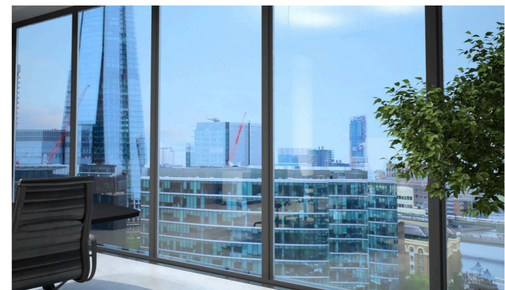
Stopray Bronze Ace-30T 6mm - 16mm 100% Air - Clear float 6mm, view from inside