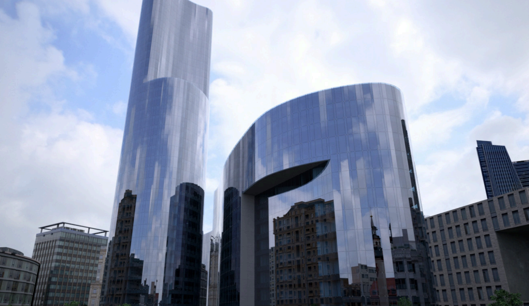
Stopray Grey Ace-30T 6mm - 16mm 100% Air - Clear float 6mm, cloudy environment