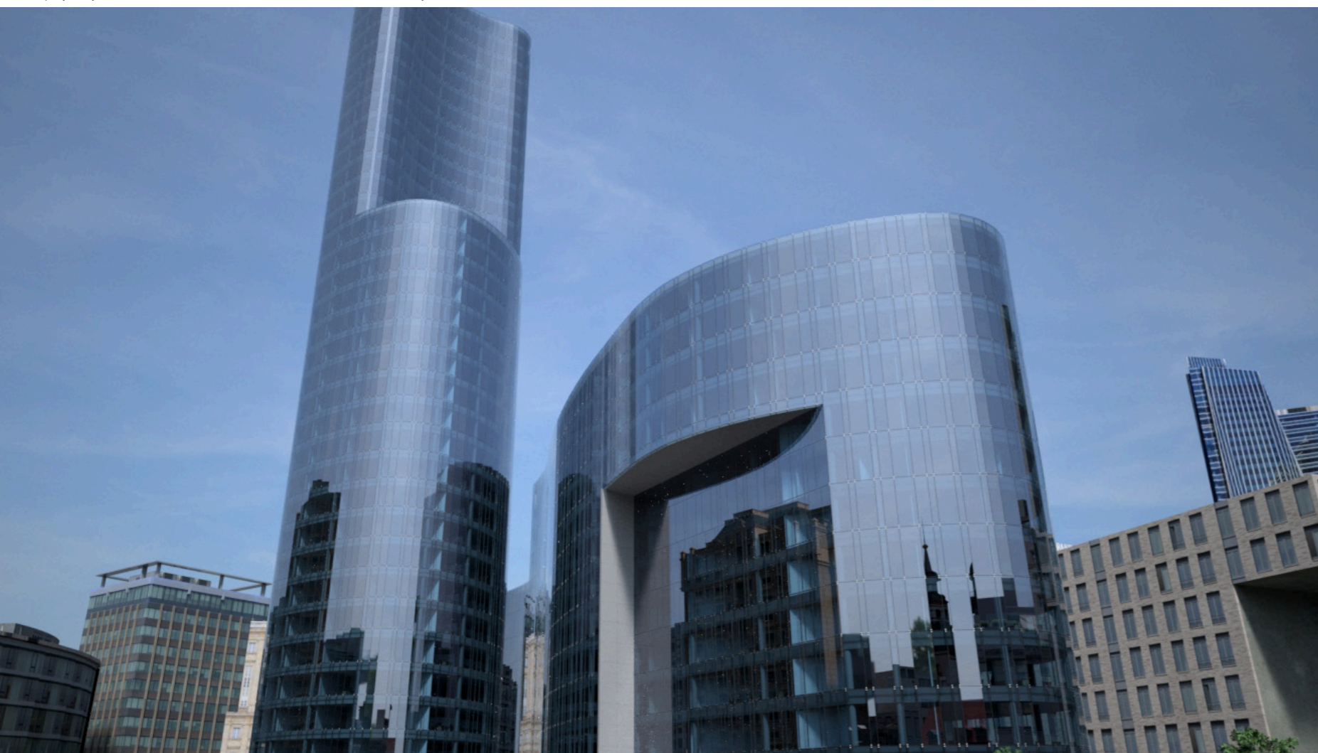
Stopray Grey Ace-30T 6mm - 16mm 100% Air - Clear float 6mm, sunny environment