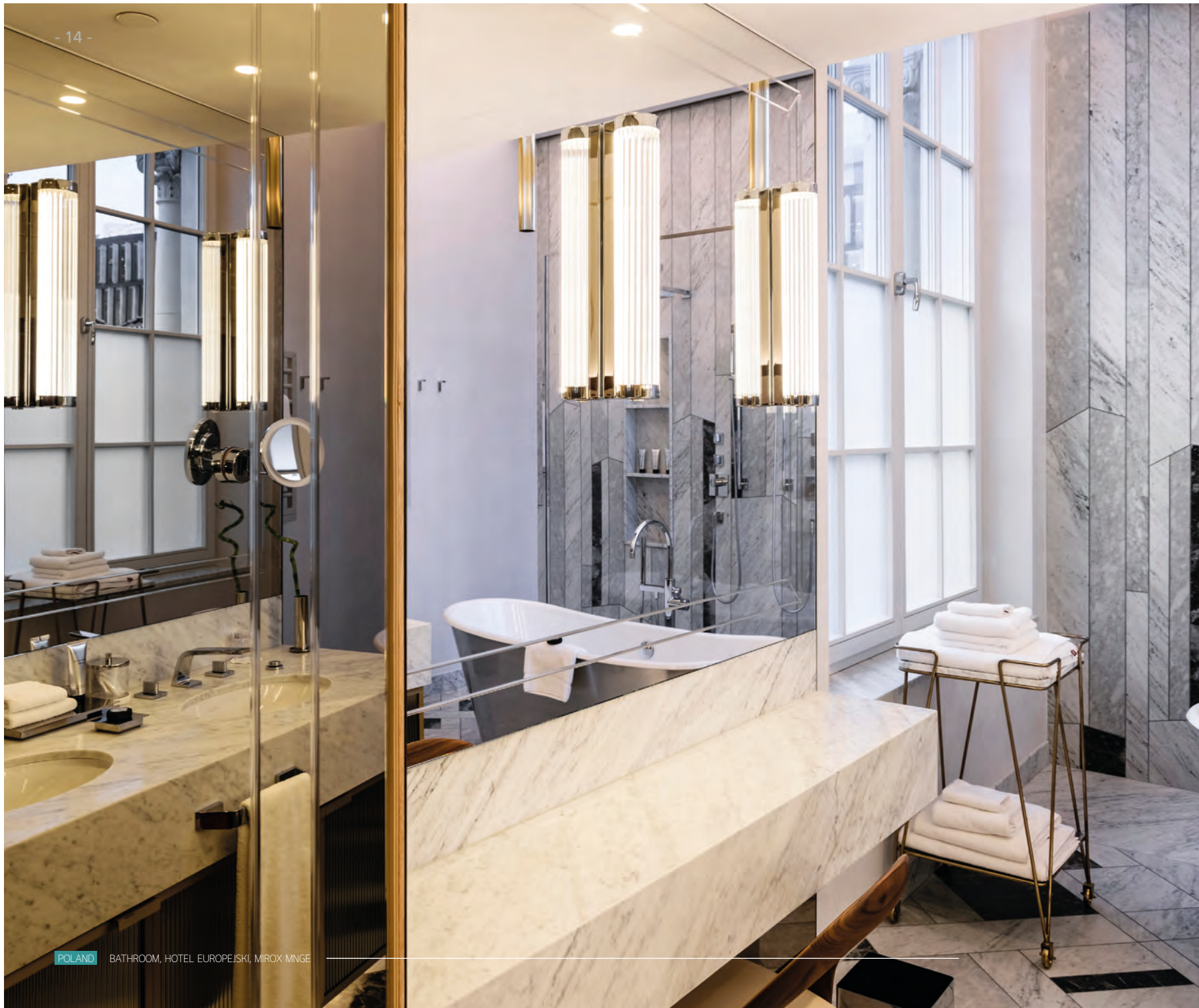
POLAND BATHROOM, HOTEL EUROPEJSKI, MIROX MNGE