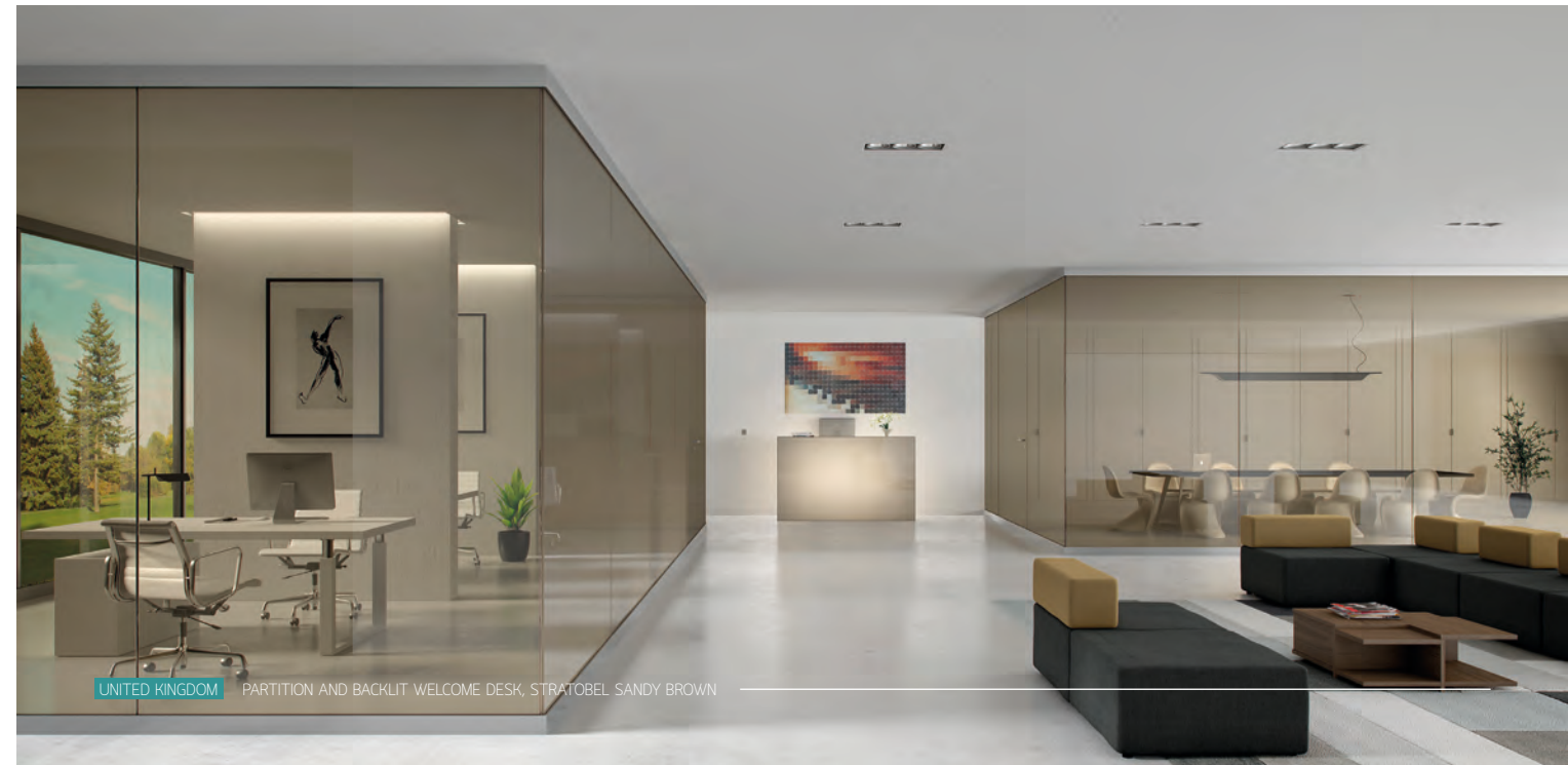
UNITED KINGDOM PARTITION AND BACKLIT WELCOME DESK, STRATOBEL SANDY BROWN

Can you guarantee safety without sacrificing style? Of course! Not only is laminated glass specially designed to keep people and property safe and secure, it also provides superb acoustic insulation – all while delivering the usual benefits of glass. Create the look you want by incorporating coloured PVB films to lend a special touch to a particular project. Whether used in doors, balustrades or partitions, every effort has been made to strike the perfect balance between design and safety, light and privacy – indoors and outdoors alike.