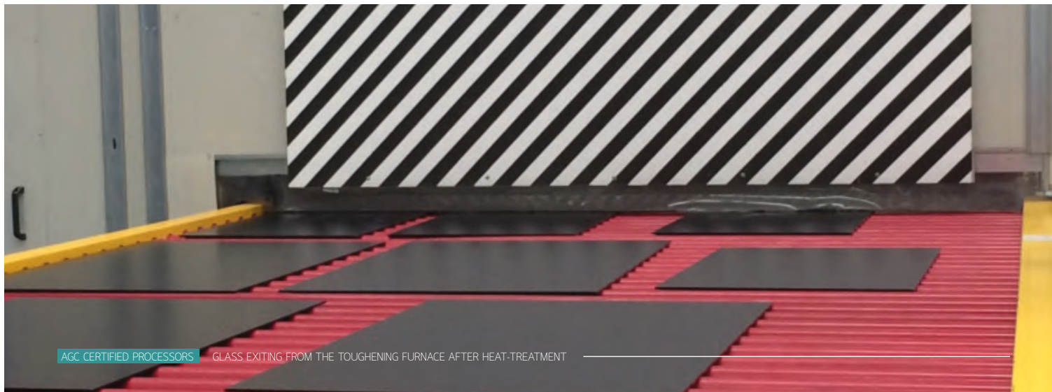
AGC CERTIFIED PROCESSORS GLASS EXITING FROM THE TOUGHENING FURNACE AFTER HEAT-TREATMENT

In 2021 AGC launched a network of decorative glass experts, called the AGC Deco partners. The aim of this network is to consolidate the expertise on our decorative products among our customers and to facilitate access to our range of products to their own clients.