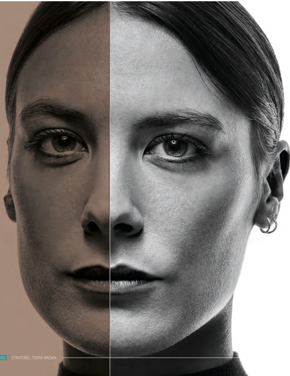
LAMINATED GLASS STRATOBEL TERRA BROWN